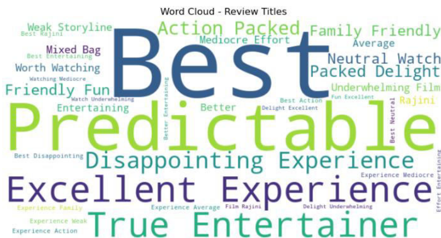
Figure 3. Figure 3: Word Cloud for Review Titles

Figure 3, prominently displays concise and impactful words used by viewers to summarize their thoughts, whereas Figure 4, texts provides a broader visualization of frequently repeated terms, showcasing detailed audience impressions about storylines, acting, and entertainment value. Together, these results demonstrate how textual analysis offers clear insights into audience sentiment and popular themes in Rajinikanth's Coolie movie reviews.