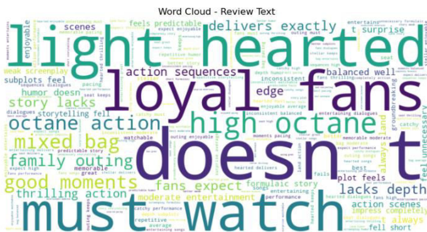
Figure 4: Word Cloud for Review

Figure 3, prominently displays concise and impactful words used by viewers to summarize their thoughts, whereas Figure 4, texts provides a broader visualization of frequently repeated terms, showcasing detailed audience impressions about storylines, acting, and entertainment value. Together, these results demonstrate how textual analysis offers clear insights into audience sentiment and popular themes in Rajinikanth's Coolie movie reviews.